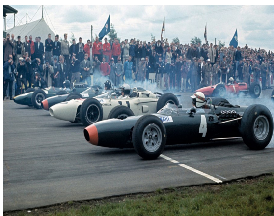
Above: The starting line up for the British Grand Prix held at Silverstone in 1965

are encouraged to develop clients in sectors where they have a personal specialism or interest, and the Firm currently has a number of clients in the art world, motor sport and private equity, to name but a few.