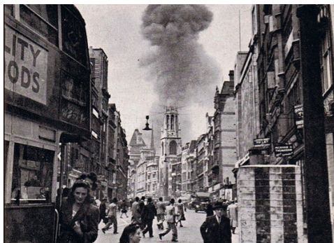
Above: A deadly V-1 flying bomb attack on Aldwych on 30 June 1944, which damaged R&H's London office.