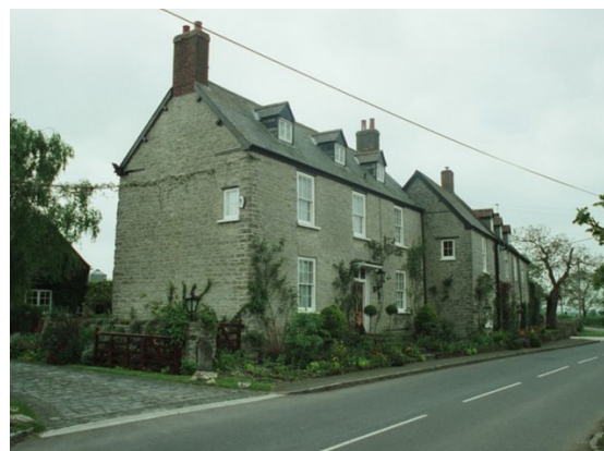
Above: Masons Farm in Oxfordshire